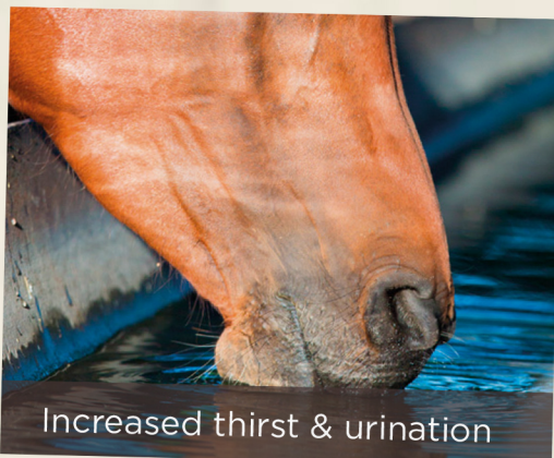
Increased thirst & urination